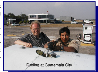
Fueling at Guatemala City

God is faithful! We could not have come this far without His backing and we will not go farther unless He continues to undergird.